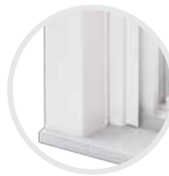
2" Brick Mold