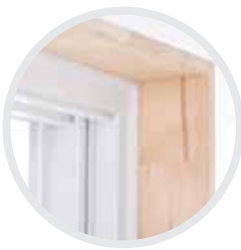
3 3/8" Wood Jamb