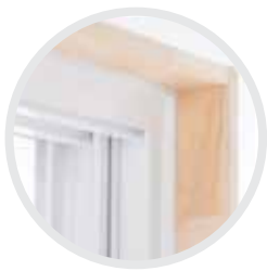
2" Wood Jamb