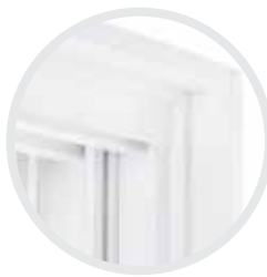
1 1/4" PVC Extension