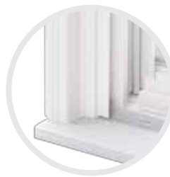
1" Brick Mold